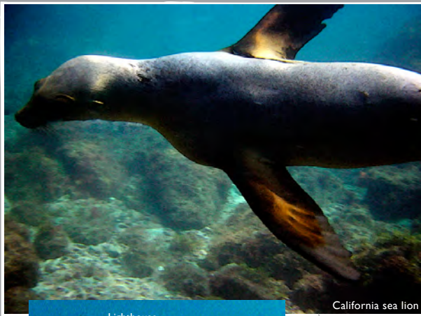
California sea lion